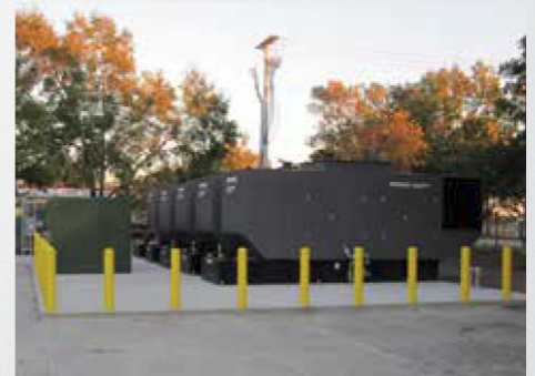
Made to grow. A 5 x 600kW bi-fuel MPS setup leaves room for one more.