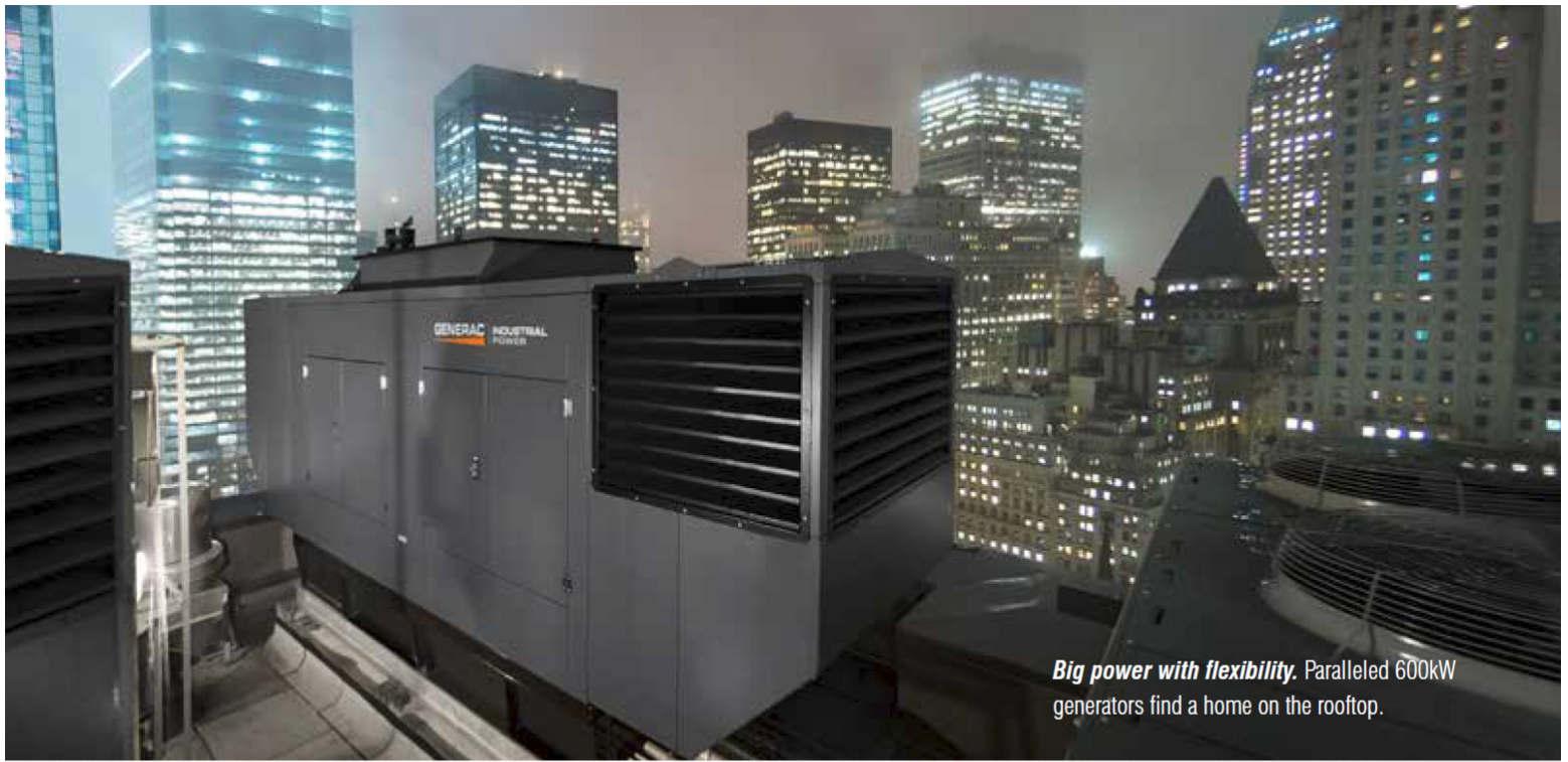
Big power with flexibility. Paralleled 600kW generators find a home on the rooftop.