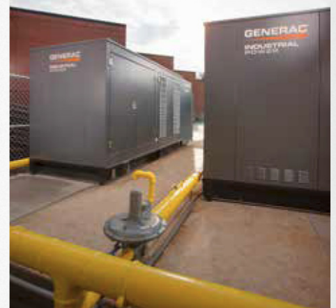
Reliability for critical loads. Two paralleled 300kW natural gas generators provide redundancy.

Begin specifying your Generac MPS solution. Call Clifford Power Systems at 1-800-324-0066 to get started.