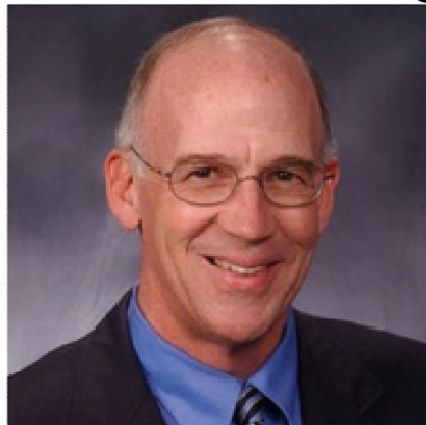
Sen. Ed Emery